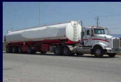
Slurry Transport by road, rail, or barge